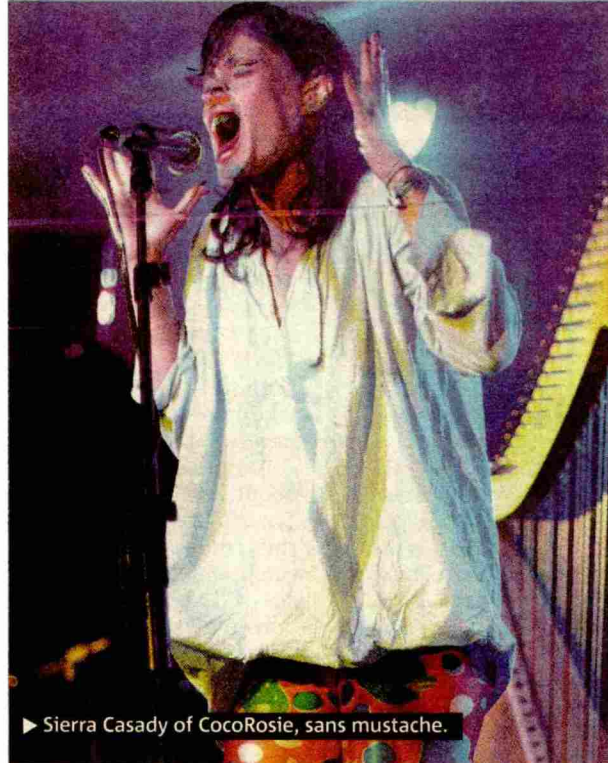
► Sierra Casady of CocoRosie, sans mustache.

move to Miami and work in a big hotel, cleaning rooms. [Laughs] I love working with my hands."